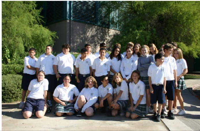
Most Holy Trinity Visits the Home of the Knights